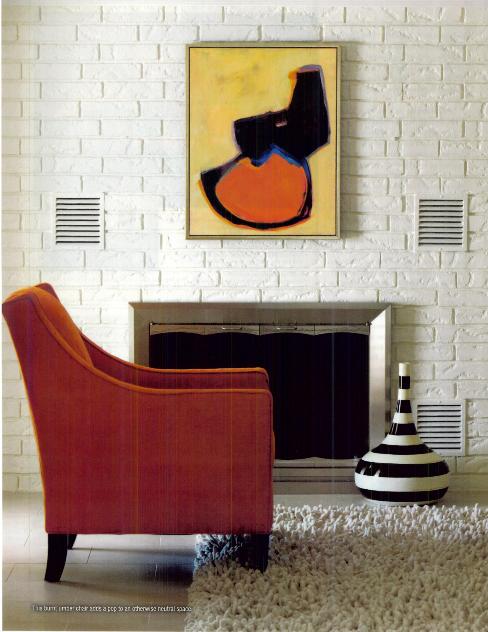
This burnt umber chair adds a pop to an otherwise neutral space.