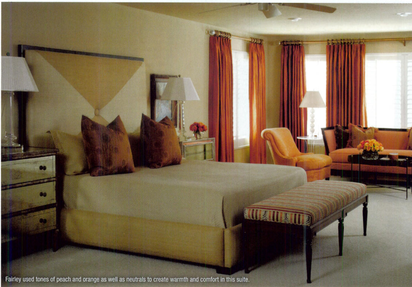
Fairley used tones of peach and orange as well as neutrals to create warmth and comfort in this suite.