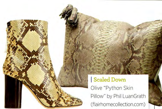
Scaled Down Olive "Python Skin Pillow" by Phil LuanGrath (flairhomecollection.com)

Osborne & Little's embroidered "Naga" fabric in golden-yellow and blue hues (osborneandlittle.com) ■ Isabel Marant "Grover" snake-effect leather boots (net-a-porter.com)