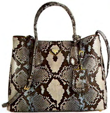
"Small Python Double Bag" by Prada (saksfifthavenue.com)

The ceramic "Rowe Lamp's" ivory-glaze base with split finish boasts hand-painted snakes. (arteriorshome.com) ■ Bulgari's "Serpenti" watch in head-over-tail design with brilliant-cut diamonds (bulgari.com)