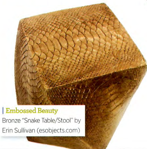
Embossed Beauty Bronze "Snake Table/Stool" by Erin Sullivan (esobjects.com)