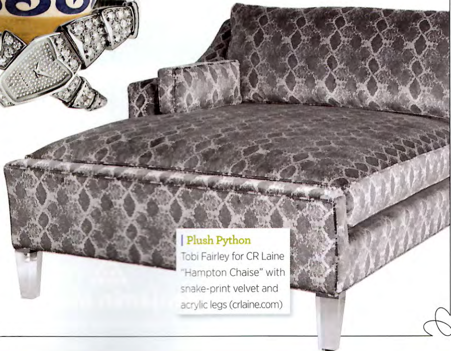
Plush Python Tobi Fairley for CR Laine "Hampton Chaise" with snake-print velvet and acrylic legs (crlaine.com)