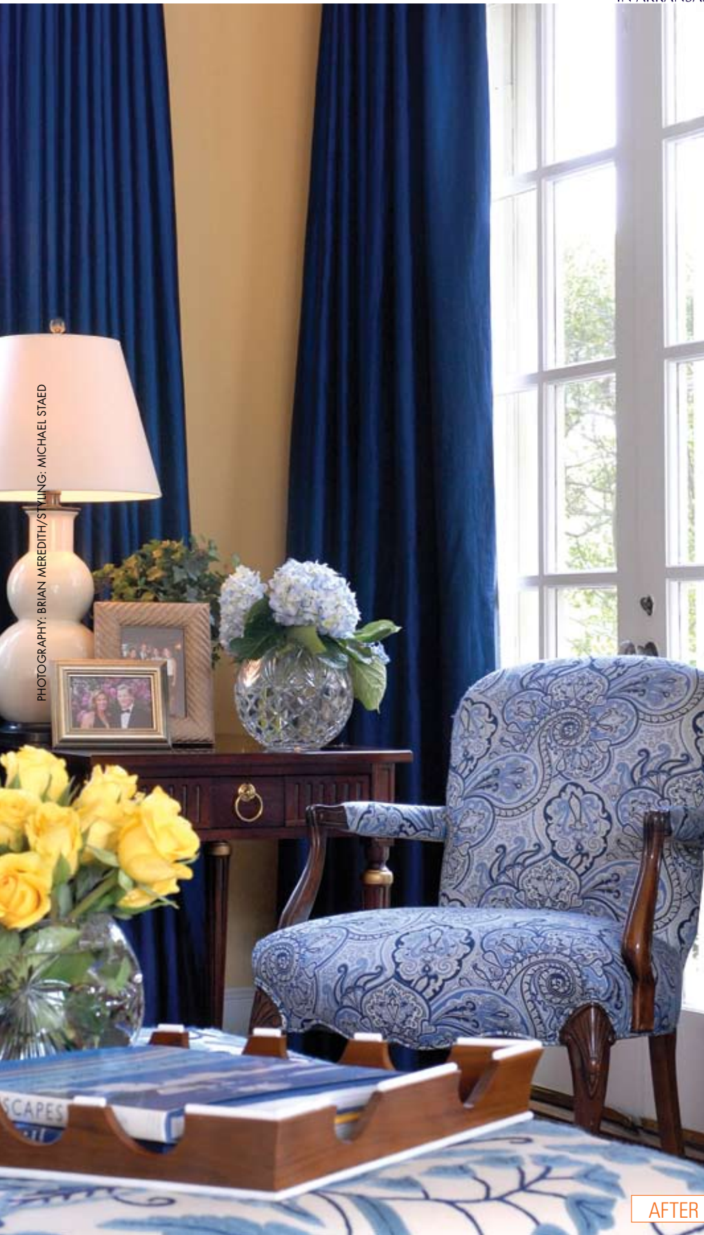
PHOTOGRAPHY: BRIAN MEREDITH/STYLING: MICHAEL STAED

Tobi's focus was on the main level of the home, as well as the master bedroom and bathroom. With the home's traditional architecture, she took a refined, classic approach with touches of modern elements. "This interior could have been designed in any decade," she says. "It's truly timeless and such a good fit with the architectural style of the home." While new pieces were