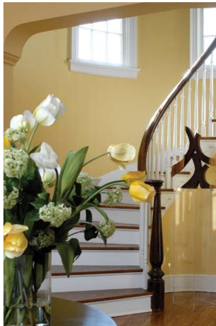
(clockwise from above) New and old pieces come together in the living room, which the Murphys describe as having a luxury hotel feel. A grand staircase greets guests in the foyer, which features a wood sculpture by Arkansas artist Robyn Horn. In the kitchen, larger windows were installed for more light, and elegant accents like the rosewood countertops and the trio of pendant lights combine with the new cabinet finish by Eric Stoll for a sophisticated, yet casual effect.