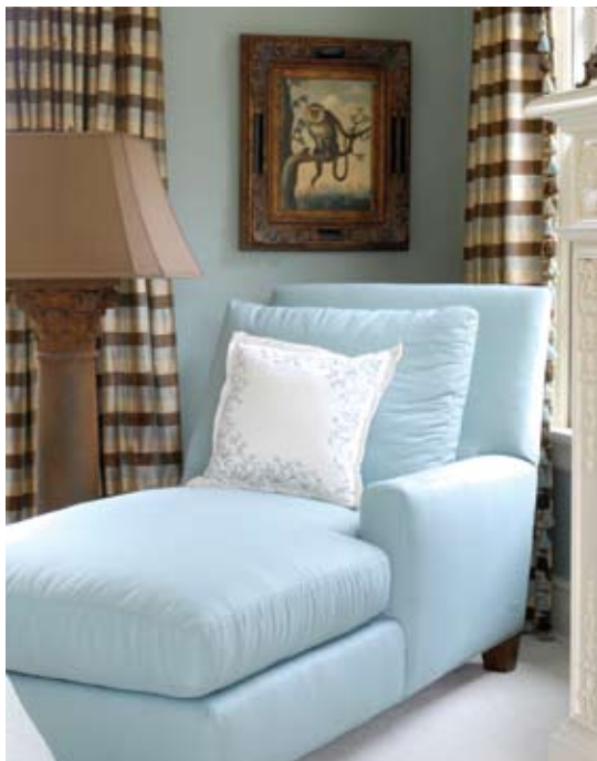
(top) The master bedroom is bathed in soothing hues and plush furnishings. (above) A cozy sitting area in the master bedroom is surrounded by the room's relaxing color palette of robin egg's blue and chocolate brown.

installed to allow more natural light into the kitchen, and the cabinets were extended to the ceiling and refaced with a custom glaze by faux finisher Eric Stoll. Tobi had rosewood countertops installed on either side of the Viking range to add warmth, while also creating a visually appealing surface.